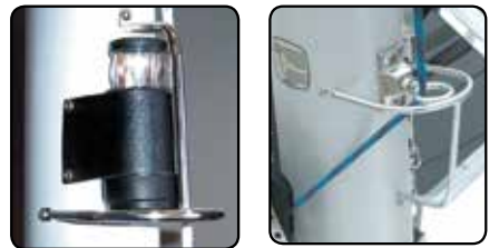
Works with Aqua Signal #254047-7 Combo Light